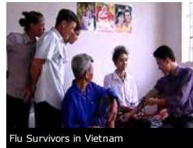
Flu Survivors in Vietnam